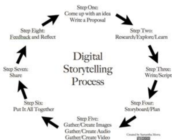
Figure 2. Eight Steps to Create Digital Stories (Samantha Morra, source: 8 Steps To Great Digital Storytelling – Transform Learning ~ written by Samantha Morra )

themselves reading their scripts. The next stage is to put it all together. This is where the magic happens – where students discover if their storyboard needs tweaking and if they have enough “stuff” to create their masterpiece. The final two steps are sharing and reflecting. Sharing online has become deeply embedded in our culture. Knowing that other people might see their work often raises student motivation to make it the best possible work that they can do. Finally, students need to be taught how to reflect on their own work and give feedback to others that is both constructive and valuable. Blogs, wikis discussion boards, and student response systems or polling tools can all be used to help students at this stage.”