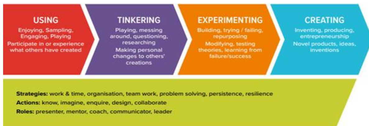
Figure 1. Loertscher et al.'s (2013) uTEC Maker Model

The uTEC Maker Model (Loertscher et al., 2013) visualizes the developmental stages of creativity from individuals and groups as they develop from passively using a system or process to the ultimate phase of creativity and invention. As illustrated in the model below, there are four levels of expertise.